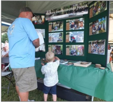
Hopkins educational display at Backyard Bash.

Backyard Bash is a community event organized by Beaver Creek Telephone Cooperative in