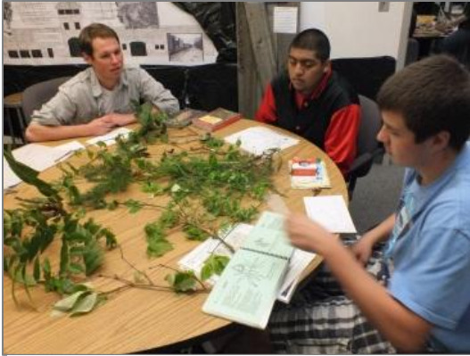
Hopkins classroom visit by program volunteer.

During 2012, most classes visiting Hopkins also received a classroom visit by staff or a program partner/volunteer prior to field studies, and often follow-up support after the Hopkins visit. 726 students in 35 classrooms benefitted from these extra sessions.