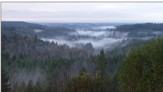
View from Forest Hall.

A favorite place ... Hopkins Demonstration Forest is open daylight hours, seven days per week, year-round. The staff's best guess is that more than 2,000 people annually visit the 140-acre woodland only fifteen minutes from the closest freeway.