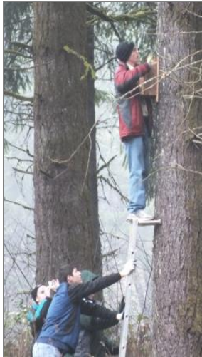
Boy Scouts hanging bird nesting boxes.

Community Forestry Days (CFDs) occur the second Saturday each month, year-round. The