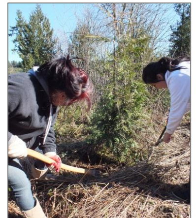
One of the service-learning activities.

Service-learning activities put tools in the hands of students who learn in the process of completing some basic forestry tasks such as tree