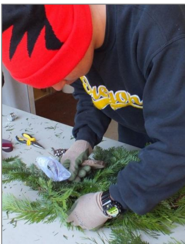
December holiday decorations.

Deck the Halls with boughs from Hopkins! Just in time for winter holidays, swag, wreaths and table centers were shared with a supporting community. It's one way to conclude a year in which we turned to our community for their support, attention, and assistance to leave a reminder of fresh cut greens as the old year turns new.