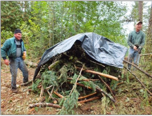
Slash piling on a Community Forestry Day in October 2012.

Much of this report so far describes learning opportunities for youth. In addition to Tree School field classes held at Hopkins, six other workshops during 2012 served 58 people, both woodland owners and general audiences.