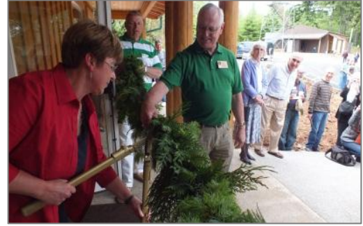
Forest Hall dedication 2012.

returned to a finished Forest Hall in 2012 to recognize the accomplishment.