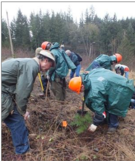
Tree planting at Hopkins.

The culminating stop of the tour included tree planting in conjunction with a group of high school volunteers. The tree farmers were asked to share their expertise in reforestation and mentor the youth in tree planting techniques. In that process all the talk at a few previous stops on the tour became very real, highlighting the Hopkins model of community forestry - learn by doing .