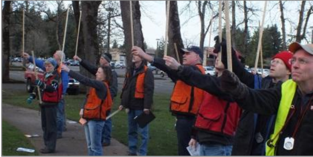
Forest measurement lab at Tree School 2012.

The same field gear used by hundreds of young students at Hopkins during our forest science programs was used for a forest measurements lab at Tree School. Over 600 people attended one or more of 68 classes held on the CCC campus.