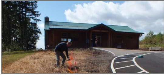
Master Gardener working on the landscape in front of Forest Hall.

Volunteers make it happen at Hopkins. Little is accomplished without the help of people who share their skills with the community.