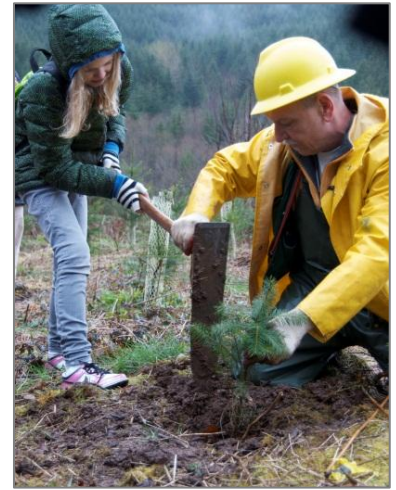
School tour at Hopkins in April.

Outreach activities most often occur off-site, to put Hopkins Demonstration Forest in front of new audiences, while remaining in touch with familiar friends. Outreach is a year-round mix of networking