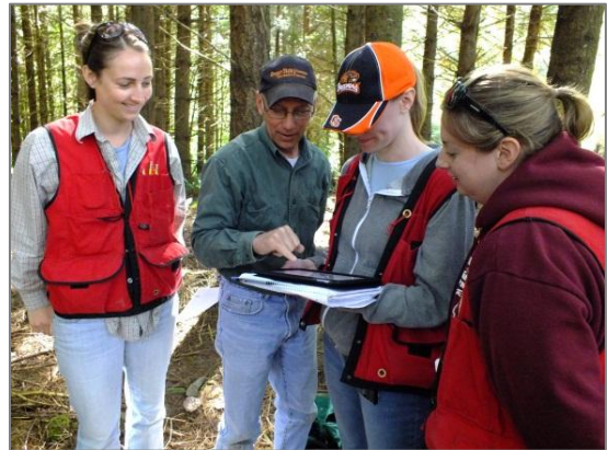
Teacher in the Woods 2012 program at Hopkins.

“The route we took was different than I have ever experienced. I did not expect to discover the forest on my own terms, become comfortable walking in the woods by myself; and I found a new lens to teach my students about the subjects that are close to my heart.