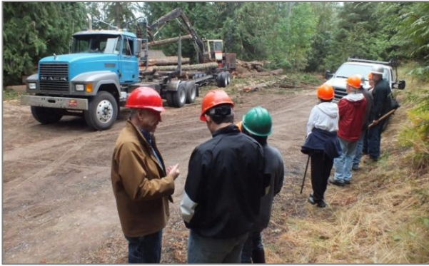
Public tour of the thinning project.

During harvest, part of the forest was closed for safety. Many guests were curious and wanted a closer look. A public tour of the uneven-age thinning project included a visit to a local mill which had purchased some of the logs and drew nine people for an up-close view.