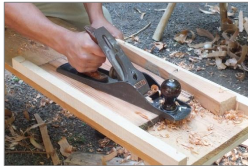
Life skills are taught at Hopkins.

Organizations, the Boy Scouts, and agencies serving at risk youth often request service opportunities for their clients at Hopkins. This is when the Forests Forever mission also serves a larger purpose in the community. In the process of accomplishing many of the essential tasks at Hopkins: tree planting; weed control; erosion control; trail maintenance; pruning; slash disposal; event support; education program support and facility cleaning, the youth participants complete an important part of their development. The young people learn and practice important life skills for success. Who else might we turn to someday to be leaders in our forests and community if our youth do not grow up capable?