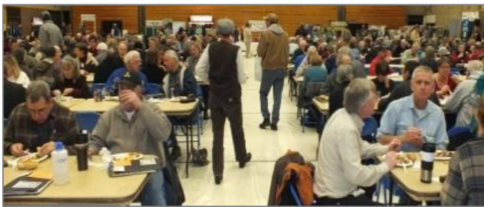
Lunchtime at Tree School 2012.

A table display featuring Hopkins Demonstration Forest was one of 55 exhibitors at Tree School. In total, at least 750 people participated in some way. It remains the largest one-day educational event focused on forestry in the state.