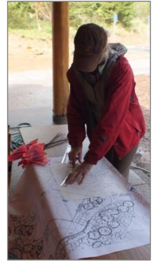
Master Gardener working on landscape plan around Forest Hall.

Board of Directors to Cub Scouts planting trees, the youth crews who work trails in summer and the college students that make field science programs possible; little is accomplished at Hopkins Demonstration Forest without volunteers.