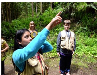
Science in the Forest program at Hopkins.

Programming in 2012 for schools at Hopkins