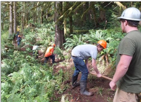
Trail work with Parrot Creek Ranch clients.

During 2012, Parrott Creek Ranch clients served as the Hopkins trail crew, completing basic maintenance on over one mile of trail, and focusing on a couple drainage problems that required special attention. It was the fifth year that Parrott Creek youth have joined the Hopkins community on a regular schedule during summer. The experience was an opportunity to work and learn outdoors, and accomplish tasks that are appreciated by the community. In 18 days, with an average of 10 participants per day, the crew put in 366 total work-hours.