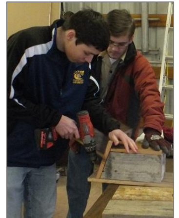
Eagle Scout project constructing nesting boxes.

As part of his Eagle Scout project, a Boy Scout led a brief workshop in the afternoon on constructing bird nest boxes. Three different styles of boxes were constructed in the shop, and then hung in the forest to provide nesting opportunities for songbirds, wood ducks and owls.