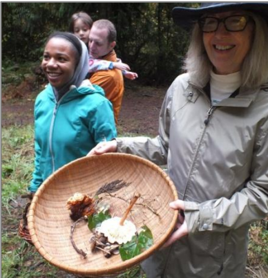
Fall Fungi in the Forest workshop.

Fall Fungi in the Forest workshop had to be postponed from October into November given