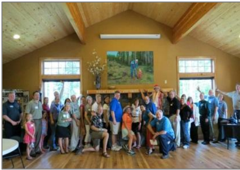
Forest Hall dedication.

Forest Hall was dedicated in July and first opened for community use in summer 2012! A dedication event brought around 120 donors,