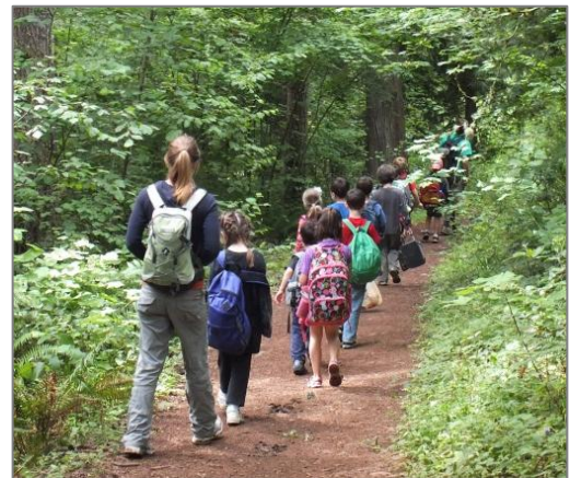
A day of summer camp at Hopkins.

Other day camps from local community centers, churches and youth clubs use Hopkins forest during school breaks. Another 900 children benefitted from the direct access to the forest. The value of a place so close to town like that little woodland nearby in decades past where children played freely all day, is hard to measure. But if you listen to the children in the forest, you will know the value of such a place is priceless.