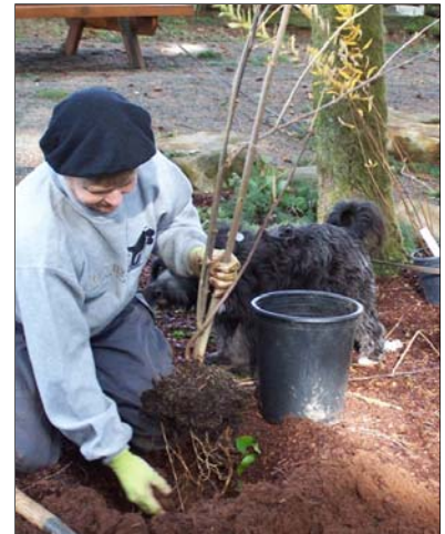
Master gardener plants native garden by Hopkins Hall.

an example for homeowners. Maintaining a landscape to reduce the risk of fire spread is critical in transitional zones known as the urban wildland interface. In the area immediately surrounding Hopkins Hall, efforts to reduce fire risk are ongoing. Related exhibits were installed many years ago.