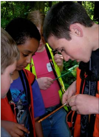
High school student helping younger students interpret a tree core during Science in the forest field studies.

during the past year allowed some high school students a value-added experience as they assumed operational responsibilities and leadership roles. On several occasions when education staff was away for extended periods, youth crews were "left in charge" as forest hosts, responsible for basic facility maintenance and interaction with guests on a daily basis. In all cases the young leaders met challenges and highly valued these opportunities for personal growth.