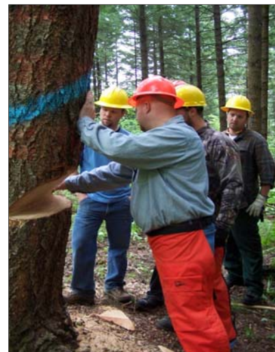
A professional faller critiques the face cut in a tree for Clackamas Community College students who came to Hopkins to learn how to safely fall and buck timber.