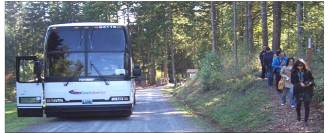
Chinese trade delegation tour group returns to their bus from a walk in the forest.

Tour groups in 2010 included State congressional staff and lobbyists, a Chinese trade delegation of 50 economic policy and business leaders and International fellows from the World Forest Institute. More common are local civic and youth organizations, college classes, general audiences and seniors. Each tour attempts to provide some direct connection to the resources in the forest. Tour audiences may learn how to identify or measure a tree rather than have the answer given. If there is anything going on of distinct interest, like logging, guest are taken a safe distance to observe.