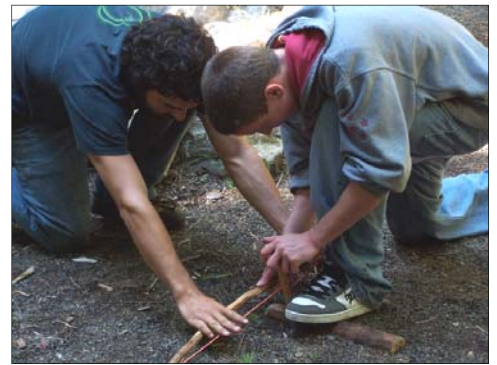
Starting a fire by friction requires a delicate balance of pressure and movement.

Hopkins on a seasonal basis for a few days at a time. The Trackers appreciated the chance to practice mentoring and were able to share their newly-learned skills with a group from a residential youth program. The Trackers were enrolled in an immersion experience program.