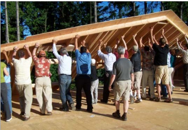
Chamber members' of Oregon City, North Clackamas County and West Linn push up south wall of the new classroom.

Community outreach exposure of HDF in the community attracts program participants, volunteers and donations through local networking and community events. A tangible benefit from outreach resulted from relationships with three local chambers of commerce; North Clackamas County, Oregon City and West Linn. During what has been an annual event for local business and civic leaders, Hopkins was again the venue for a summer BBQ and social mixer. Challenged to provide a compelling experience for guests, the coincidence of construction of the new classroom with the event date, led to another hands-on opportunity that could not be missed.