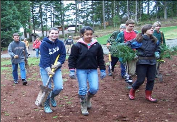
Middle school students plant seedlings at Hopkins.

Programs for youth include school-based and out-of-school activities, for groups and individuals. Types of youth programs offered are tours, field science, vocational and career development, and service projects. During 2010, over 1,850 young people benefitted from youth programming associated with Hopkins Demonstration Forest.