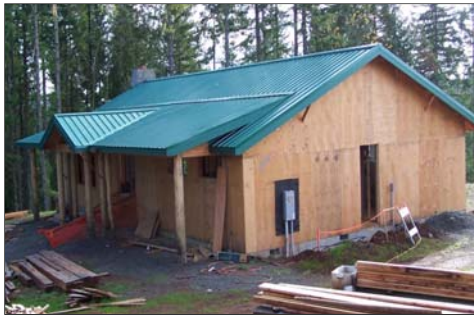
'Under construction' forestry and natural resources classroom and meeting hall at HDF.

The project started with a $50,000 challenge from the Ramsay and Waldorf families from Molalla in late 2007. Since, then more than 160 individuals, companies and organizations contributed funds, supplies and services totaling about $260,000. The construction project goal is $325,000. We