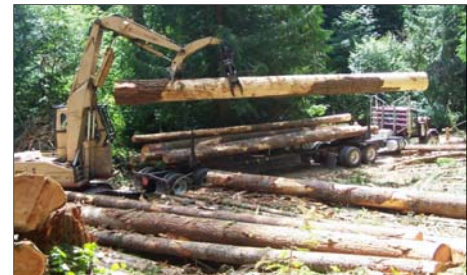
2010 logging at Hopkins Demonstration Forest.

The harvest removed about 55,000 board feet of mostly Douglas-fir in an area containing a 60 year old forest stand.